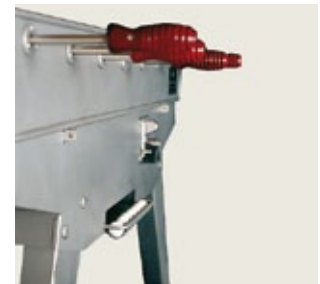
Photo-detailing model with rounded corners and lines equipped with interior money bag. Wooden handles