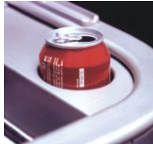
Coaster design details

The models SC/3 and SC/4 are made in electrozinc plate covered in polyester paint of high quality and durability. Adapted for indoor installation.