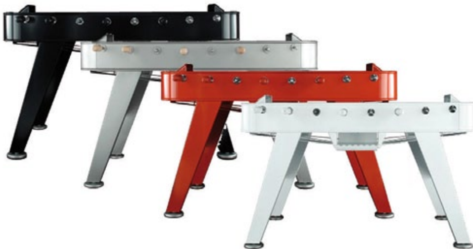
Range of colors to choose