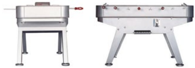
Side views with elegant and sleek lines

Compact playground of 6 mm in thickness treated to last through rough weather. Held with solid moldings of PVC of high durability and stability.